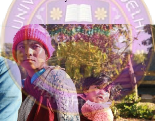
Figure 4: A Local Woman with Her Kid

If a girl is pregnant before marriage then the boy and girl are not given any punishment from the tribe and also that boy is not forced to marry the girl. For khasi's snakes are metaphorically their babies. They restrain themselves from killing of snakes during pregnancy as they too put out their tongues like babies do, also their skin texture is as soft as a new born baby.