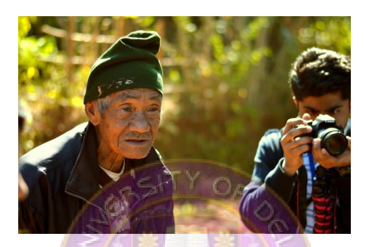
Figure 5: Old Khasi Man Talking About Folklores and Myths

A rich and a poor man were childhood friends who belonged to the same village, but as time passed on the latter moved to a distant village after marriage. The duo managed to spend time together whenever the poor man made a visit to the village to meet his family. Every time they met, the rich man made it a point that he offered him sumptuous meal. But the villagers of the poor man gossiped and questioned the reality of their friendship. To prove his friendship the poor man thought of inviting him home. Unfortunately they ran out of food and none of the villagers offered any sort of help. The disheartened couple committed suicide. On the very same night a notorious thief entered their house. Seeing the dead bodies, he feared that the villagers would blame him for the murder and he killed himself. In sorrow of loss of his friend, rich man prays to God. And as an equalizer between the rich and the poor, God creates three trees from each soul. Since then offering Kwai (areca nut, lime paste and betel nut) to guests is a part of the Khasi etiquette.